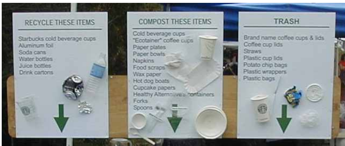
Mansfield Festival requires vendors to use compostable plates, cups and utensils.

So, now that you're excited about your trashy task, where do you begin?