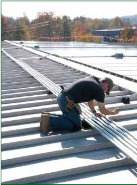
Installation of Siemon's solar power system.

How much of an environmental steward can a company be? Siemon Company tries to cover everything from energy to recycling as well as reducing hazardous substances and climate emissions at their worldwide corporate headquarters and manufacturing center in Watertown, Connecticut.