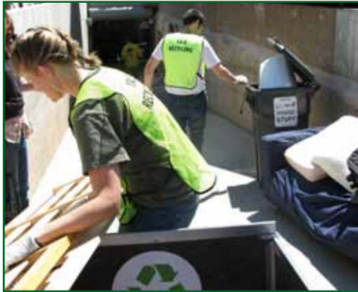
Yale's "Spring Salvage"

Did you know that the average college student produces about 640 pounds of trash each year? Since Connecticut is home to dozens of colleges and universities, that adds up to a lot of trash!