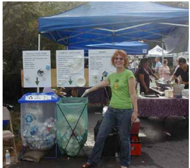
Recycling, composting and trash containers at Mansfield Festival on the Green

We're not trying to rush summer, but before you know it, we'll be thinking about fairs, fall sports and other seasonal events. Whether the occasion is a large or small gathering, one thing is certain — there will be plenty of trash to clean up afterwards.