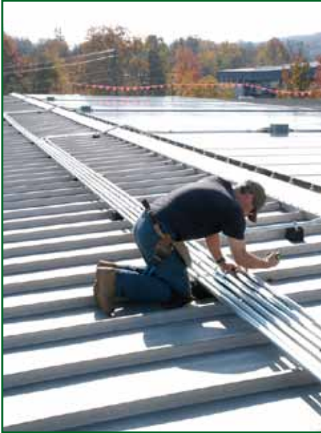
Installation of Siemon's solar power system.

How much of an environmental steward can a company be? Siemon Company tries to cover everything from energy to recycling as well as reducing hazardous substances and climate emissions at their worldwide corporate headquarters and manufacturing center in Watertown, Connecticut.