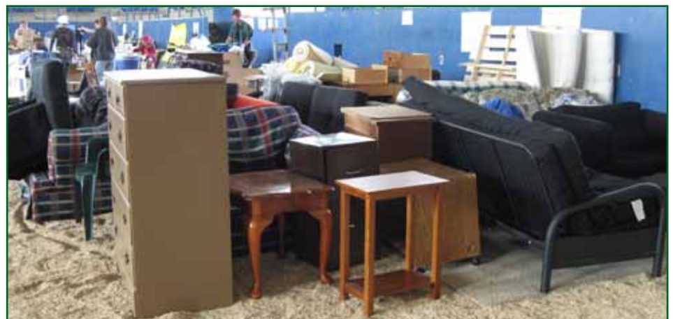
UConn's "Give and Go"

Both universities report that students are pleased that their items go to a good cause and that there is an alternative to throwing those items out. The programs reduce waste and demonstrate the Universities' commitment to sustainability.