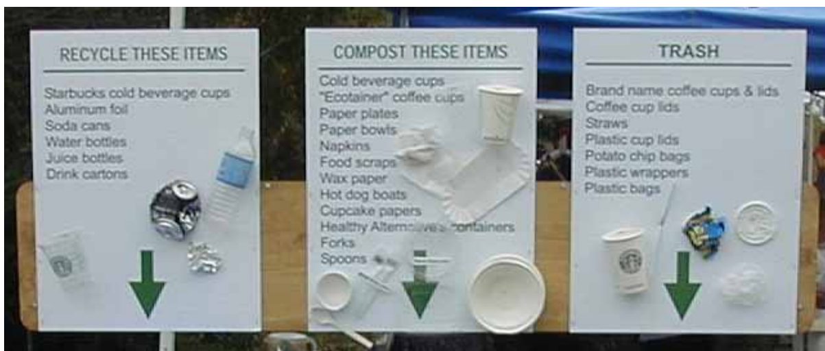
Mansfield Festival requires vendors to use compostable plates, cups and utensils.

So, now that you're excited about your trashy task, where do you begin?