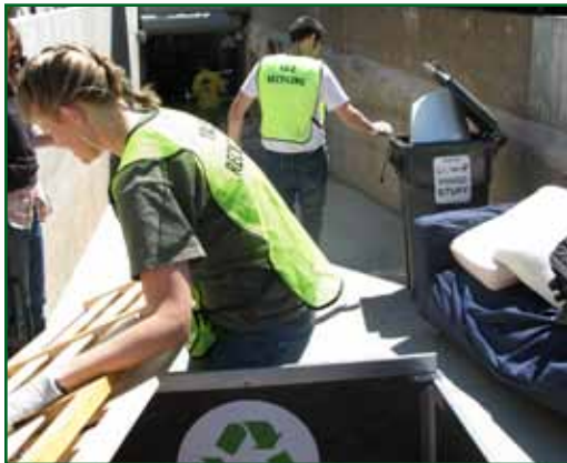
Yale's "Spring Salvage"

Did you know that the average college student produces about 640 pounds of trash each year? Since Connecticut is home to dozens of colleges and universities, that adds up to a lot of trash!